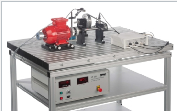
The illustration shows PT 500.12 together with PT 500, PT 500.01, PT 500.14 and PT 500.04.